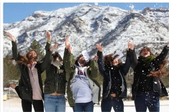
Junior girls playing in snow at Pine Springs Ranch during Bible Camp January 2017